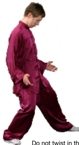
Do not twist in the ankles